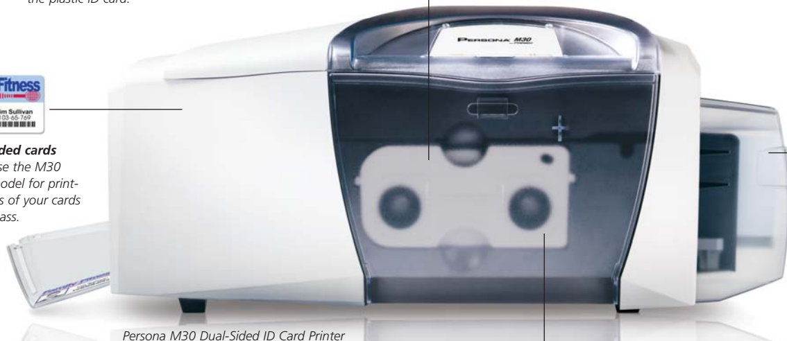
Persona M30 Dual-Sided ID Card Printer

Print two-sided cards faster. Choose the M30 Dual-Sided model for printing both sides of your cards in one easy pass.